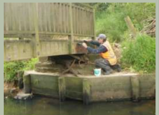
Graffiti busting at the bridge.