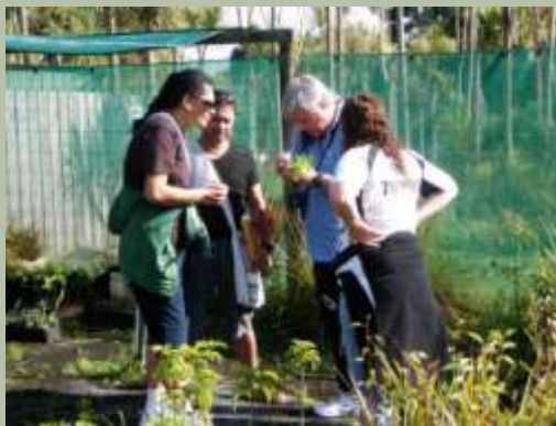
Pouako - Environmental Studies students from Te Whare Wānanga o Awanuiārangi studying the root structure of native seedlings at the Friends of Oakley Creek nursery.