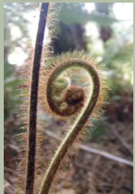
Wheki koru unfolding.

A series of interesting facts about forests is continually cycling at the bottom of the major image on this UN web page. Have a look at them, then, join us in contributing to the growth and enhancement of the Oakley Creek 'forest'!