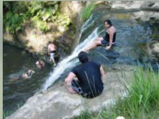
Summer fun at the waterfall.