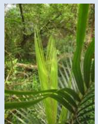
Toetoe flower unfolding; nikau, new growth