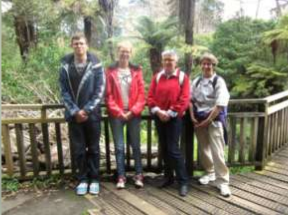
Left: Auckland Tree Council - Trees in the Environment Course - as part of their course, some of the participants came for a guided walk along Oakley Creek