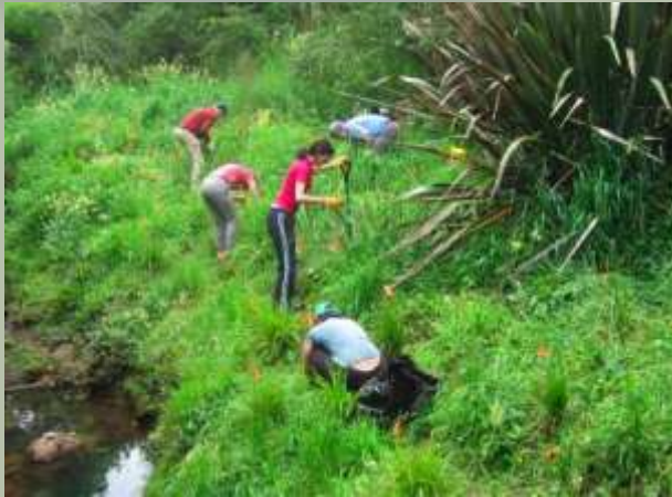
November Community working bee - at Phyllis Reserve bridge.

Before, during and after the October Community working bee - what a difference many hands make! The volunteers did a great job of digging out heaps of onion weed as well as other weeds, then laying down the mulch, supplied by Auckland Council.