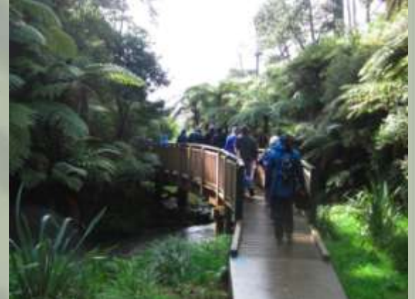
Right: Heritage Festival Guided Walk