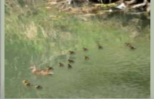
White tailed spider at the nursery; damselfly larvae, found below the waterfall; 'You have how many children?'