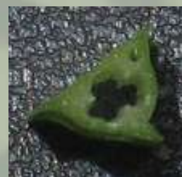
Above: Bulbs and bulbil;