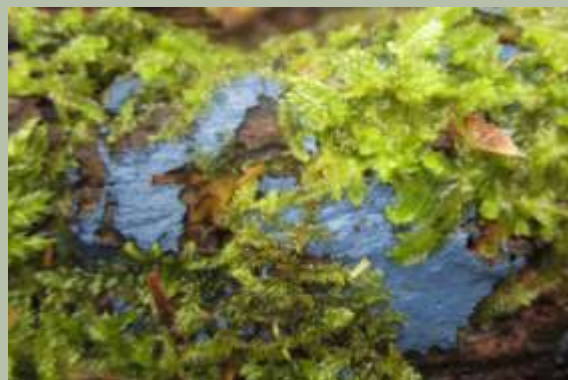
A blue lichen.

If you would like to receive your Friends of Oakley Creek Update at a higher resolution (about 7 MB), for a better quality result, then please let us know at info@oakleycreek.org.nz