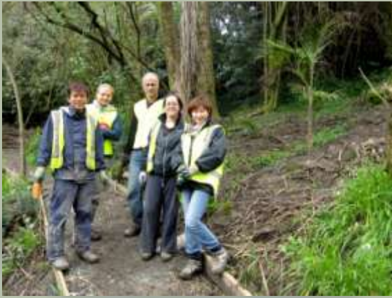
A Local CVNZ Team worked at the Cradock St bridge site.