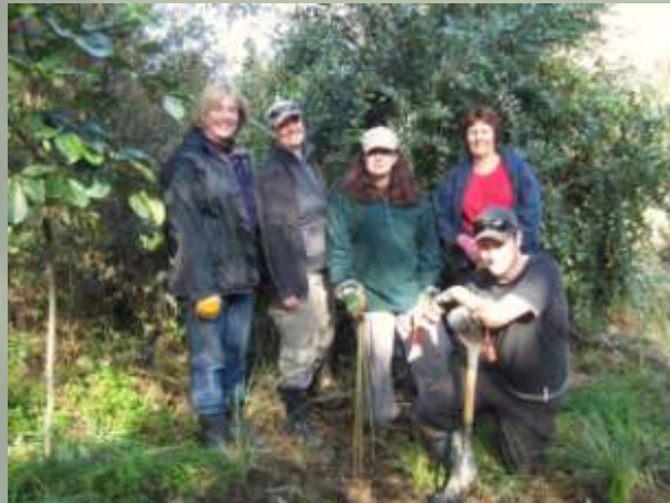
Students from the Open Polytechnic (left) came planting as part of their course work.