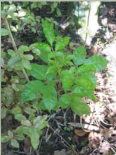
A young puriri, Vitex lucens.