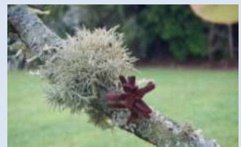
Top: Bag moth case on a miro tree.