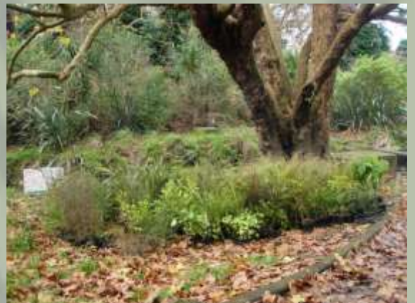
These plants, ready and waiting, were supplied by Te Ngahere , who also provided the labour,