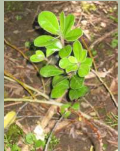
Karo, Pittosporum crassifolium.

Our forest giants are getting in on the act as well, with seedling puriri, karaka and totara trees found in places. They don't always establish themselves in convenient places though - one baby totara was found right beside the concrete walkway.