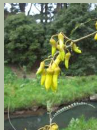
From left: Kumerahou or gumdigger's soap, Pomaderris kumeraho; new Doodia australis fronds; and kowhai, Sophora sp.