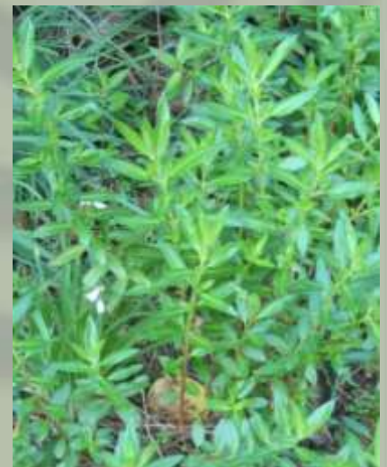
Toatoa is forming a new understorey.

One of the benefits of limiting chemical spraying and stopping wholesale weed-eating on the banks of the creek has been the emergence of a great diversity of native ferns. These are also popping up in shady spots along the paths and where rocks provide cool damp growing conditions. Native herbs like toatoa ( Haloragis erecta ) and poroporo ( Solanum aviculare ) are also now common on the lower creek.