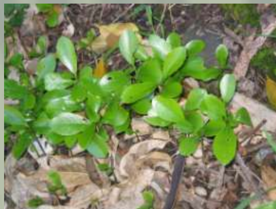
Karaka, Corynocarpus laevigatus - a grove in miniature.

With a little help from our volunteers, the bush around Oakley Creek is now starting to regenerate at a visibly faster rate. Without weeds like Tradescantia (wandering jew) covering the ground and with more shade to suppress grasses, we are starting to see lots of native seedlings emerging. The most common plants springing up are nurse species like karamu, mapou and mahoe, but there are also lots of bird spread species like cabbage tree, karo, hangehange and kawakawa. In more open areas on the western alluvial side of the creek, wind spread manuka seedlings are appearing.