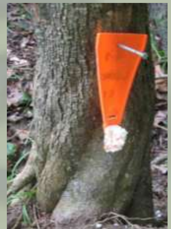
Waxtag after being chewed by a possum.