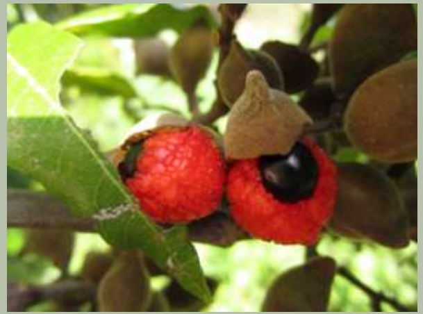
Titoki, Alectryon excelsus fruit with cap.