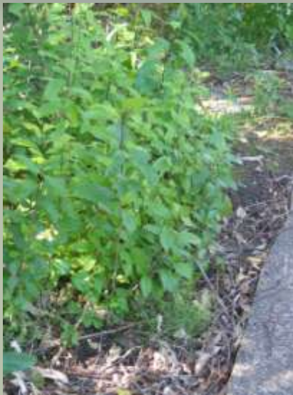
Mahoe, Melicytus ramiflorus, seedlings.