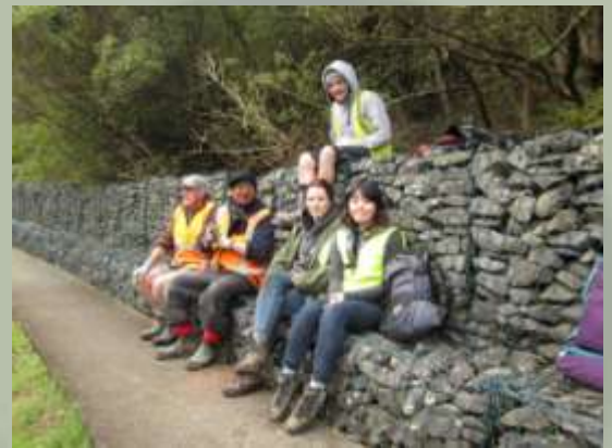
Conservation Volunteers NZ local team took a break (right) on what may be the 'longest park bench' in New Zealand (and maybe the world!).