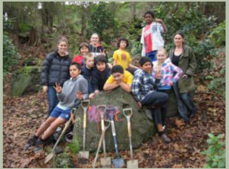
Waterview Primary students planted too (right).