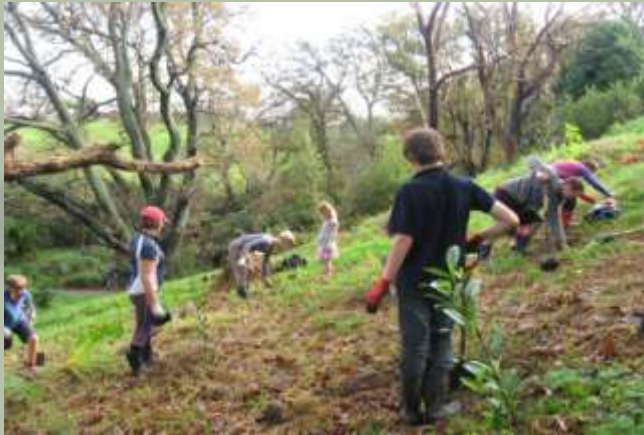
A morning's work produces a great result - thank you!

A big thank you goes to those who gave, received and/or helped plant the gift trees, following our promotion over the last few months. A most enjoyable morning was spent putting the young plants in along the Walkway, downstream from the Unitec Residence. It will be wonderful to keep track of these special trees and see how they grow in the years to come.